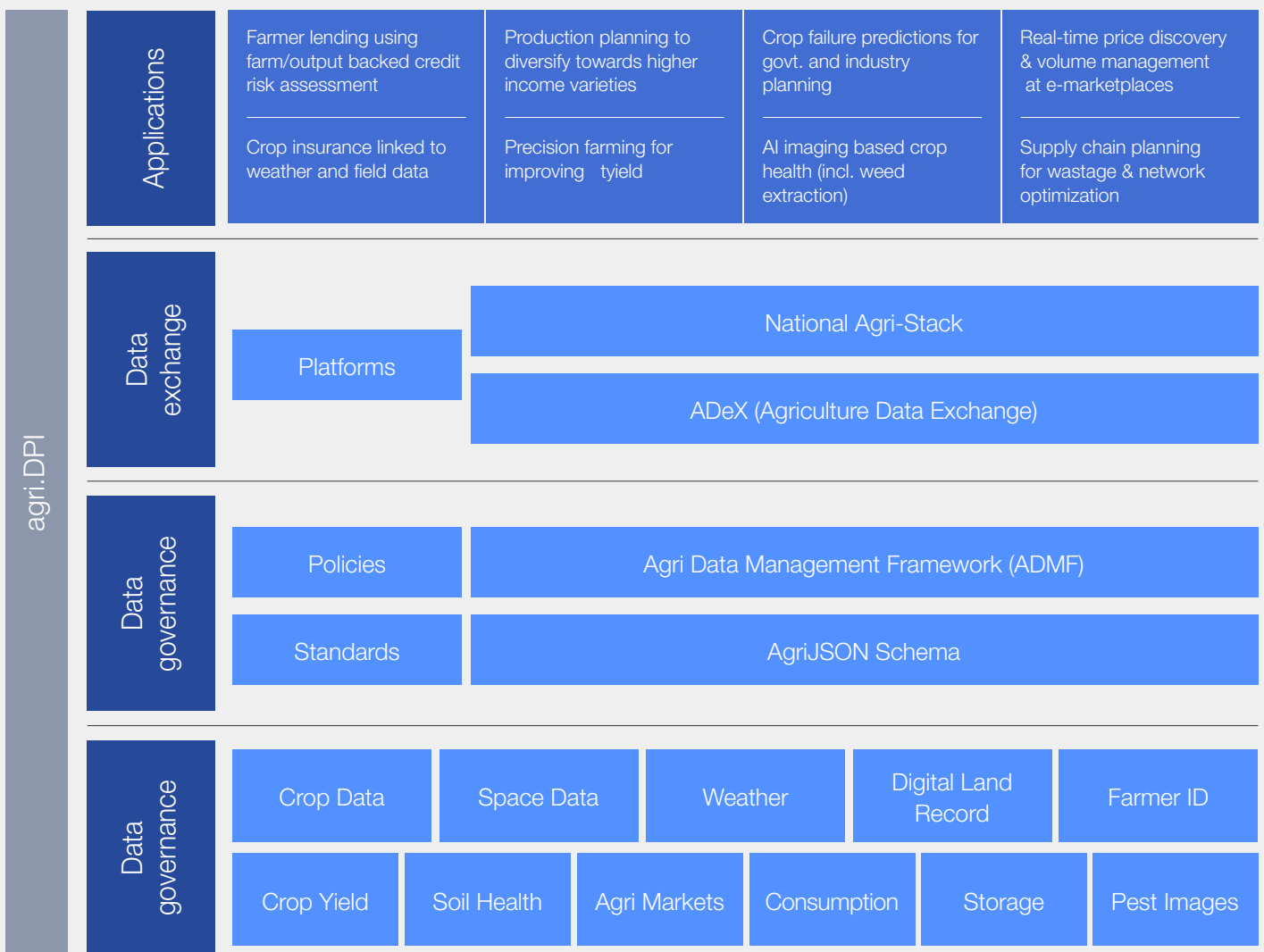
FIGURE 1 Agriculture DPI framework