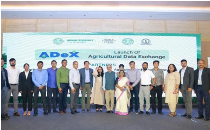
ADeX and ADMF launch on 11 August 2023